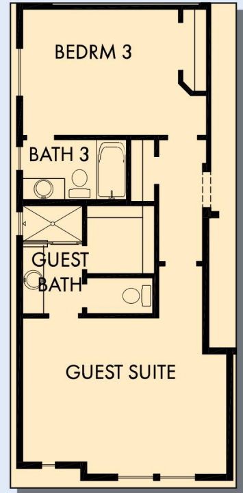
OPTIONAL GUEST SUITE AT BEDROOM 4