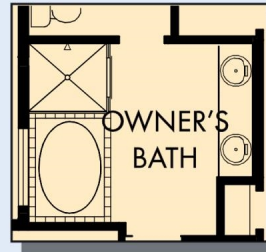
OPTIONAL DROP-IN TUB AND SEPARATE SHOWER AT OWNER'S BATH