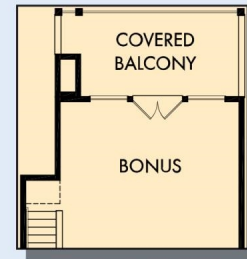
OPTIONAL COVERED BALCONY AT BONUS

For additional options, please visit DavidWeekleyHomes.com