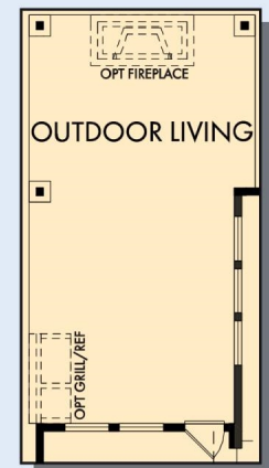
OPTIONAL OUTDOOR LIVING