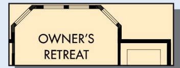
OPTIONAL BAY WINDOW AT OWNER'S RETREAT