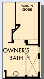
OPTIONAL EXPANDED SHOWER AT OWNER'S BATH