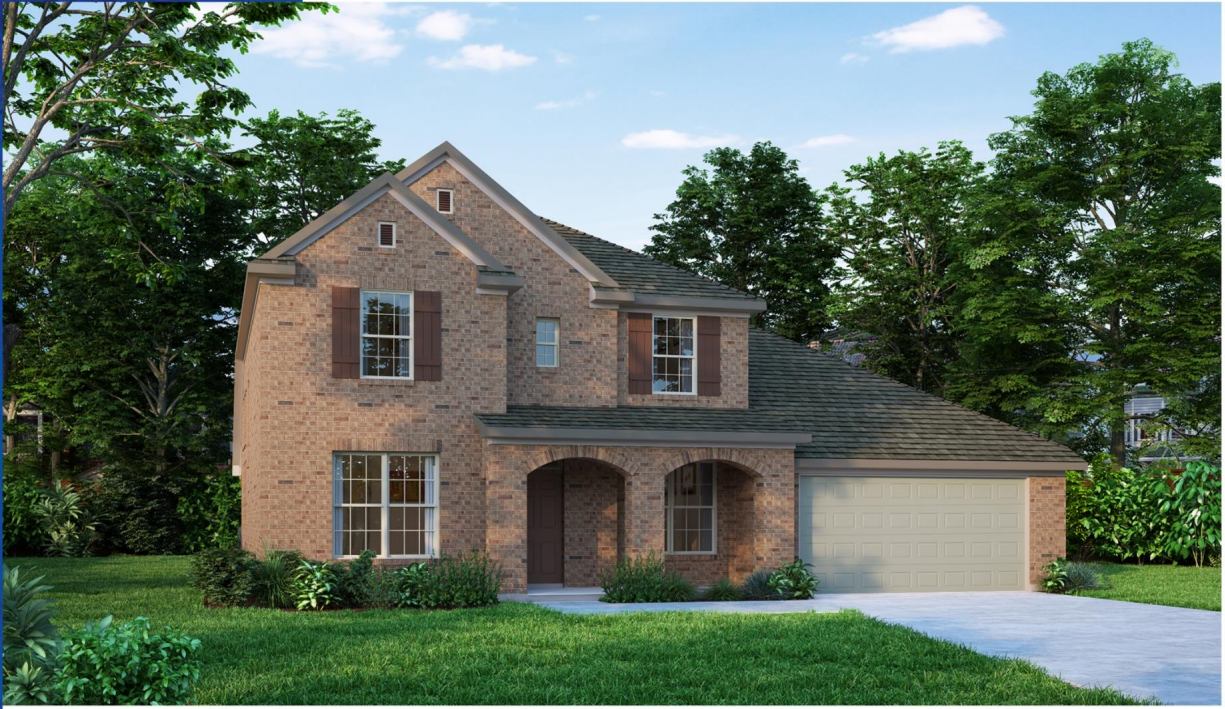
6690 DAL - A