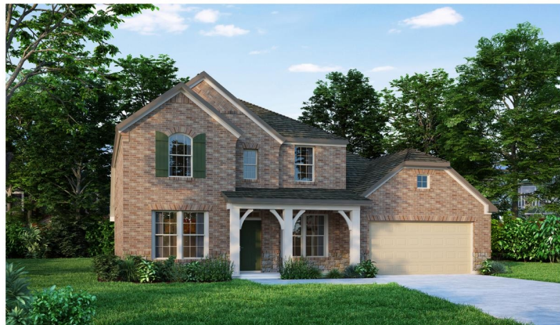
6690 DAL - B