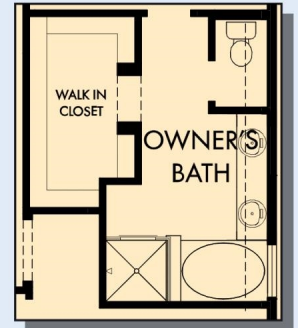
OPTIONAL SLIDE-IN TUB WITH SEPARATE SHOWER AT OWNER'S BATH