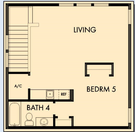
OPTIONAL RETREAT WITH WET BAR ABOVE GARAGE