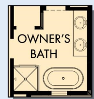
OPTIONAL FREE STANDING TUB WITH SEPARATE SHOWER AT OWNER'S BATH

For additional options, please visit DavidWeekleyHomes.com