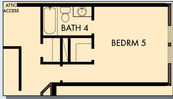
OPTIONAL BEDROOM 5 WITH BATH 4 AT RETREAT