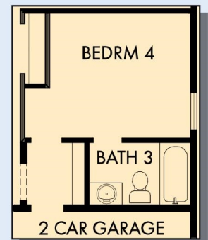
OPTIONAL BEDROOM 4 WITH BATH 3 AT STUDY