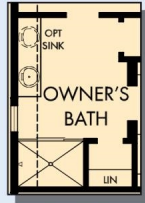
OPTIONAL SHOWER AT OWNER'S BATH