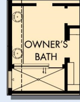
OPTIONAL WALK-IN SHOWER AT OWNER'S BATH