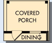
OPTIONAL COVERED PORCH AT DINING