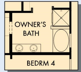
OPTIONAL SLIDE IN TUB WITH SEPARATE SHOWER AT OWNER'S BATH