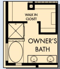
OPTIONAL OWNER'S BATH

1,966 sq. ft. • 3 Bedrooms • 2 Full Baths • 1 Half Bath • 2 Car Garage