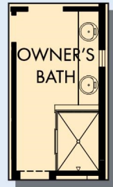
OPTIONAL STAND ALONE SHOWER AT OWNER'S BATH