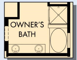
OPTIONAL SLIP-IN TUB WITH SEPARATE SHOWER AT OWNER'S BATH