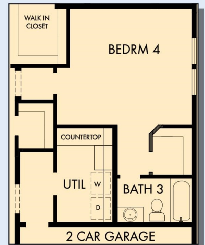
OPTIONAL EXTENDED BEDROOM 4 AND BATH 3