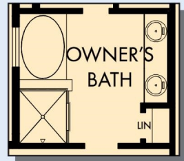
OPTIONAL SLIP-IN TUB WITH SEPARATE SHOWER AT OWNER'S BATH