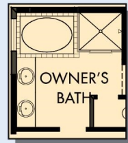
OPTIONAL SEPARATE DROP-IN TUB AND SHOWER AT OWNER'S BATH