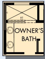
OPTIONAL SUPER SHOWER AT OWNER'S BATH