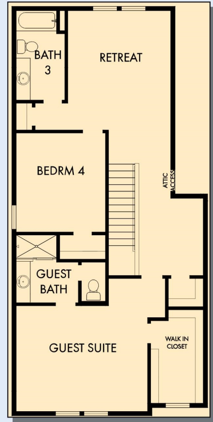
SECOND FLOOR WITH OPTIONAL GUEST SUITE WITH BATH

For additional options, please visit DavidWeekleyHomes.com