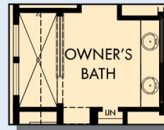
OPTIONAL WALK-IN SHOWER AT OWNER'S BATH