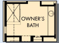
OPTIONAL STAND-ALONE SHOWER AT OWNER'S BATH