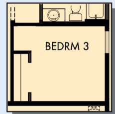
OPTIONAL BEDROOM 3 AT STUDY