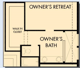
OPTIONAL SUPER SHOWER AT OWNER'S BATH