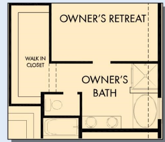
OPTIONAL SEPARATE TUB AND SHOWER AT OWNER'S BATH