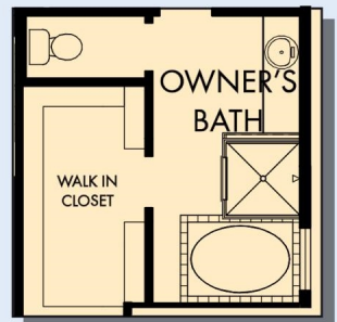
OPTIONAL DROP IN TUB WITH SEPARATE SHOWER AT OWNER'S BATH