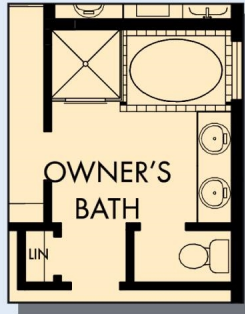
OPTIONAL DROP IN TUB WITH SEPARATE SHOWER AT OWNER'S BATH