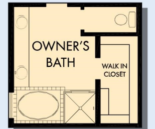
OPTIONAL DROP IN TUB WITH SEPARATE SHOWER AT OWNER'S BATH