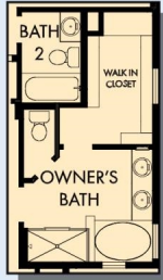
OPTIONAL SEPARATE TUB AND SHOWER AT OWNER'S BATH