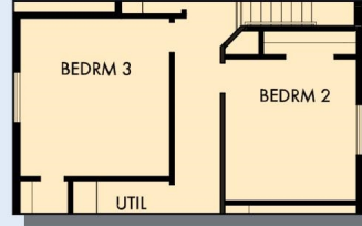
OPTIONAL EXTENDED BEDROOM 2 AND BEDROOM 3