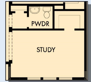
OPTIONAL STUDY WITH POWDER BATH AT BEDROOM 3 AND BATH 3