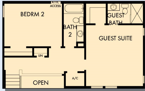
OPTIONAL GUEST SUITE