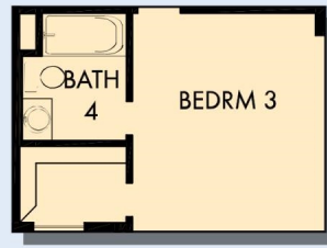
OPTIONAL BATH 4 AT BEDROOM 3