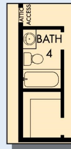
OPTIONAL BATH 4 AT CLOSET

For additional options, please visit DavidWeekleyHomes.com