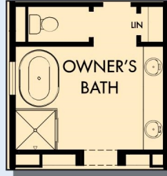
OPTIONAL FREE-STANDING TUB WITH SEPARATE SHOWER AT OWNER'S BATH