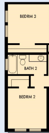
OPTIONAL BEDROOM 3 AT STUDY