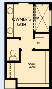
OPTIONAL SUPER SHOWER