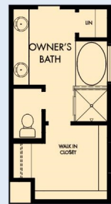
OPTIONAL OWNER'S BATH WITH SEPARATE SHOWER AND SEPARATE TUB