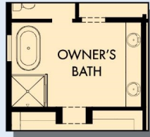
OPTIONAL FREE STANDING TUB WITH SEPARATE SHOWER AT OWNER'S BATH