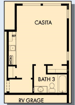
OPTIONAL CASITA AT BEDROOM 4