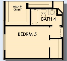
OPTIONAL BEDROOM 5 WITH BATH 4 AT STUDY