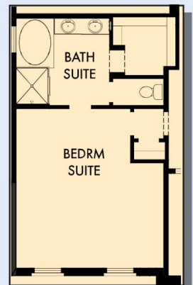
OPTIONAL BEDROOM SUITE WITH BATH SUITE AT BEDROOM 2 AND 3