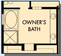
OPTIONAL DROP IN TUB WITH SEPARATE SHOWER AT OWNER'S BATH

3,150 - 3,162 sq. ft. • 4 - 5 Bedrooms • 3 - 4 Full Baths • 1 Half Bath • 3 Car Garage