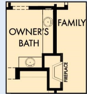
OPTIONAL WALL FIREPLACE AT FAMILY