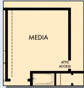
OPTIONAL MEDIA AT ATTIC ACCESS