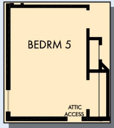
OPTIONAL BEDROOM 5 AT RETREAT