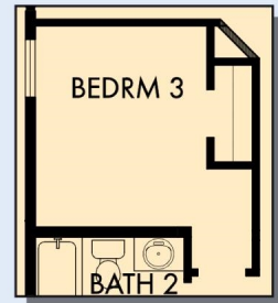
OPTIONAL BEDROOM 3 AT STUDY