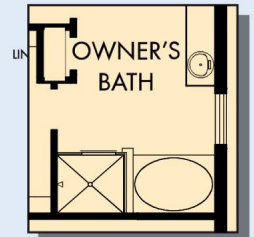
OPTIONAL SEPARATE TUB & SHOWER AT OWNER'S BATH