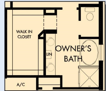
OPTIONAL OWNER'S BATH WITH SEPARATE SHOWER AND TUB