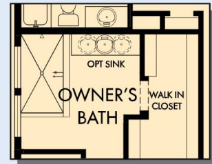
OPTIONAL SUPER SHOWER AT OWNER'S BATH