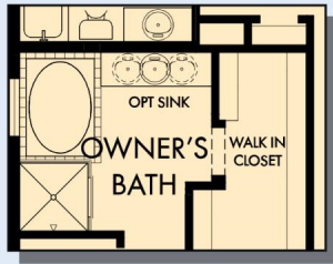
OPTIONAL SEPARATE TUB WITH SHOWER AT OWNER'S BATH