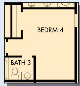
OPTIONAL EXTENDED BEDROOM 4