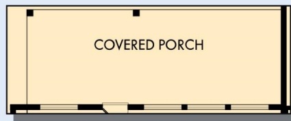
OPTIONAL EXTENDED COVERED PORCH