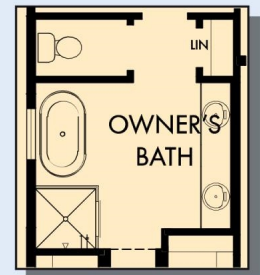
OPTIONAL FREE-STANDING TUB WITH SEPARATE SHOWER AT OWNER'S BATH