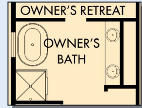
OPTIONAL FREE-STANDING TUB WITH SEPARATE SHOWER AT OWNER'S BATH

For additional options, please visit DavidWeekleyHomes.com