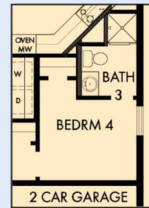
OPTIONAL BEDROOM 4 WITH BATH 3 AT GARAGE