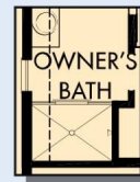
OPTIONAL SHOWER AT OWNER'S BATH