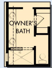
OPTIONAL WALK-IN SHOWER AT OWNER'S BATH