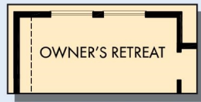
OPTIONAL EXTENDED OWNER'S RETREAT

1,853 - 1,901 sq. ft. • 3 Bedrooms • 2 Full Baths • 2 Car Garage