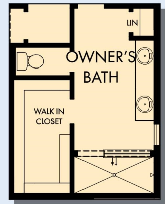
OPTIONAL SUPER SHOWER AT OWNER'S RETREAT