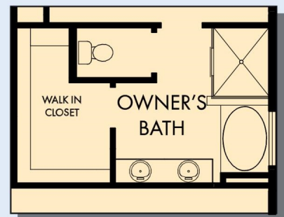
OPTIONAL SEPARATE TUB & SHOWER AT OWNER'S BATH