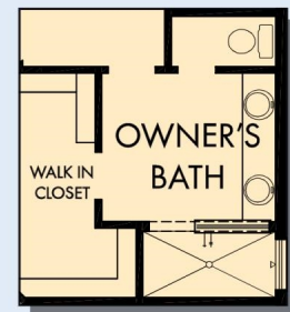
OWNER'S BATH OPTIONAL SUPER SHOWER AT OWNER'S BATH