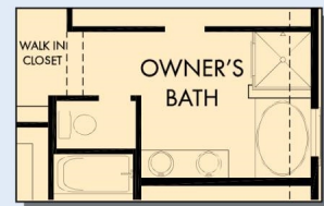
OPTIONAL SLIP-IN TUB WITH SEPARATE SHOWER AT OWNER'S BATH