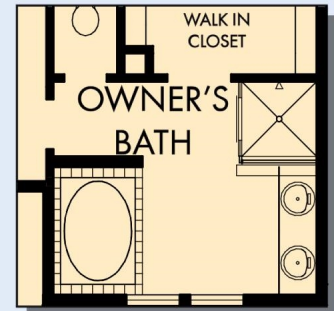
OPTIONAL SEPARATE TUB AND SHOWER AT OWNER'S BATH

For additional options, please visit DavidWeekleyHomes.com