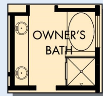
OPTIONAL SLIP IN TUB WITH SEPARATE SHOWER AT OWNER'S BATH