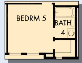
OPTIONAL BEDROOM 5 WITH BATH 4 AT RETREAT