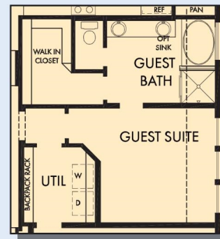
OPTIONAL GUEST SUITE WITH GUEST BATH AT BEDROOM 4 AND 3